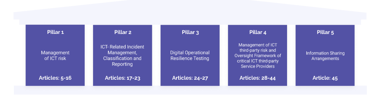
Figure 2. The Five Pillars of DORA

There are five essential elements of DORA, with some being far more extensive than others. Some of these are complete, but others contain additional details in the DORA standards, the Regulatory Technical Standards (RTS), Implementing Technical Standards (ITS) and guidelines. See Appendix 1 for a full list and relevant DORA articles.