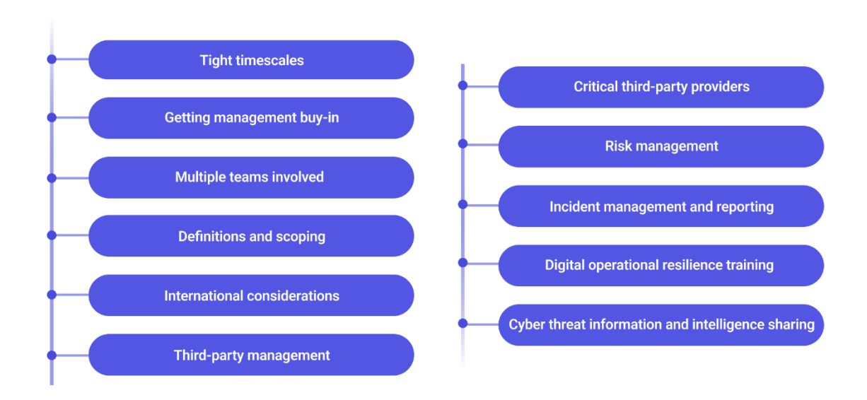
Figure 4. Challenges associated with implementing DORA compliance project